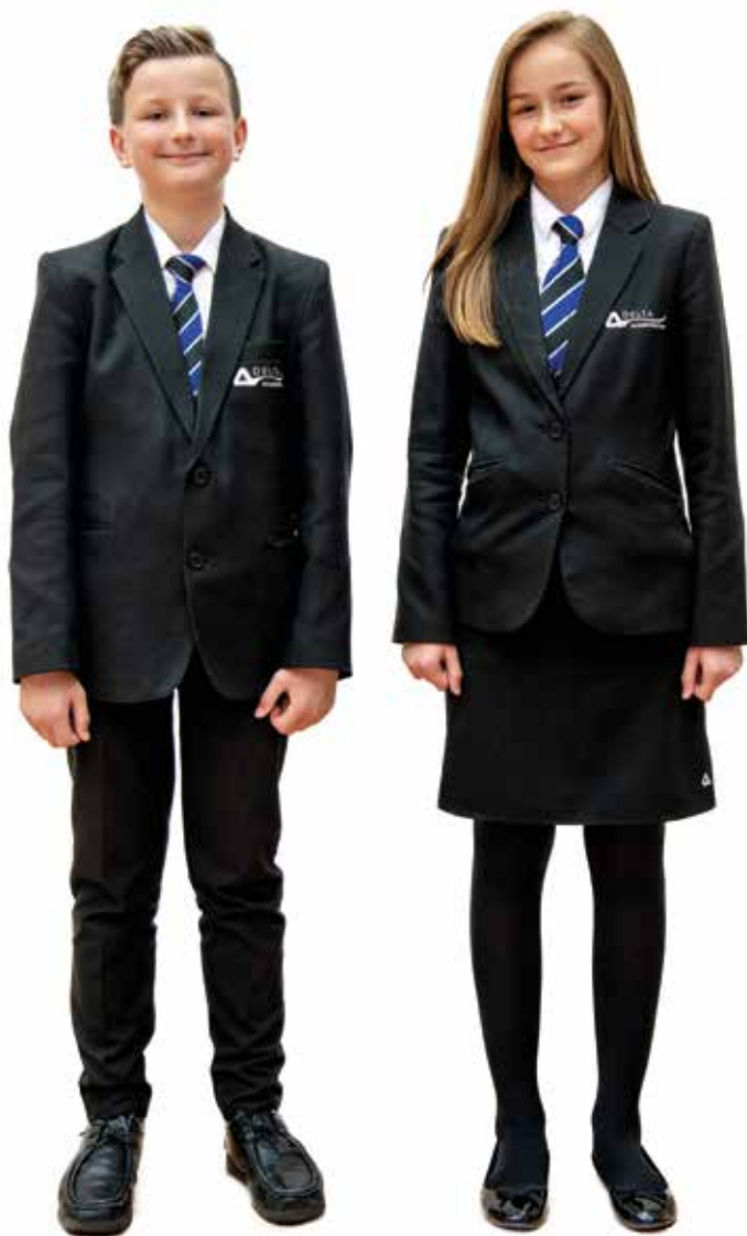
Compulsory Academy Uniform