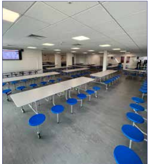
Our Dining Facilities